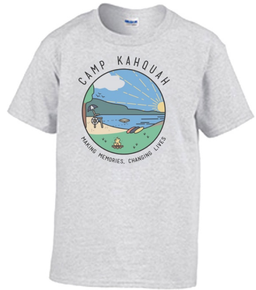
Sample Camper Shirt

Not an exact representation. Shirt colour and style may vary.